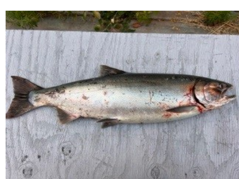
Figure 1 salmonoid mort from SFL

On Thursday 7 September 2023, at approximately 0630, JDA fisheries personnel found a dead Chinook salmon on the sidewalk near the count station (see fig. 1). It was determined the fish had jumped out of the ladder from above and fell on the sidewalk. A fish was previously found in the same location in 2020 (see fig. 2)